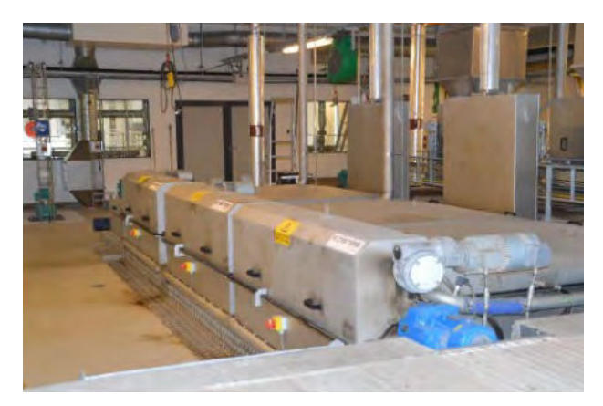
Three of the six SFK600 Salsnes Filters installed at the Plant

P.E.: 80,000 Influent TSS: 234 mg/L Effluent TSS: 95 mg/L Particle Size: 0 - 100 mm Max. Flow Rate: 589 L/s (13.4 MGD) Dewatered Sludge: 25% Total Solids