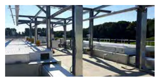
Eight SFK600 Salsnes Filters installed into channels

P.E.: 170,000 Particle Size: 0 - 100 mm Dry Weather Flow Rate: 1200 m<sup>3</sup>/h (7.6 MGD) Max. Flow Rate: 3600 m<sup>3</sup>/h (22.8 MGD) Rain weather flow TSS Removal: 50% COD Removal: 30% Dewatered Sludge: 40% Total Solids