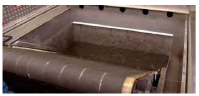
Filters are installed in channels and have integrated dewatering.