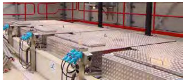
Four of the eight SFK600 Salsnes Filters installed at the plant

P.E.: 320,000 Particle Size: 0 - 100 mm Dry Weather Flow Rate: 1600 m<sup>3</sup>/h (10 MGD) Max. Flow Rate: 3200 m<sup>3</sup>/h (20.2 MGD) TSS Removal: 30 - 50% COD Removal: 10 - 25% Dewatered Sludge: 28% Total Solids