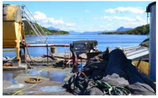
Egersund Net, Kristiansund (archive photo)

Micro-fouling can clog the nets of closed cage systems, impeding water flow. For this reason, periodically, nets are dismantled and sent to stations on land for washing, repair and re-coating. The Salsnes Filter system provides treatment for this wash water before its discharged back into the environment.