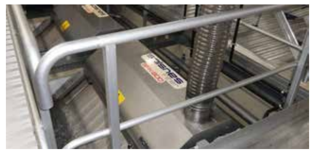
Salmar Follafoss, Norway (Salmon smolt farm)

The Salsnes Filter system has integrated thickening and dewatering processes to help reduce the impact of sludge disposal by producing a smaller volume of drier sludge. An optional vacuum system can be applied to bring dry content levels as high as 30% and reduce sludge volume to 0.48m<sup>3</sup> per ton of fish feed. As an alternative to disposal, sludge produced from our system can be used for biogas production or as an ingredient in fertilizer.